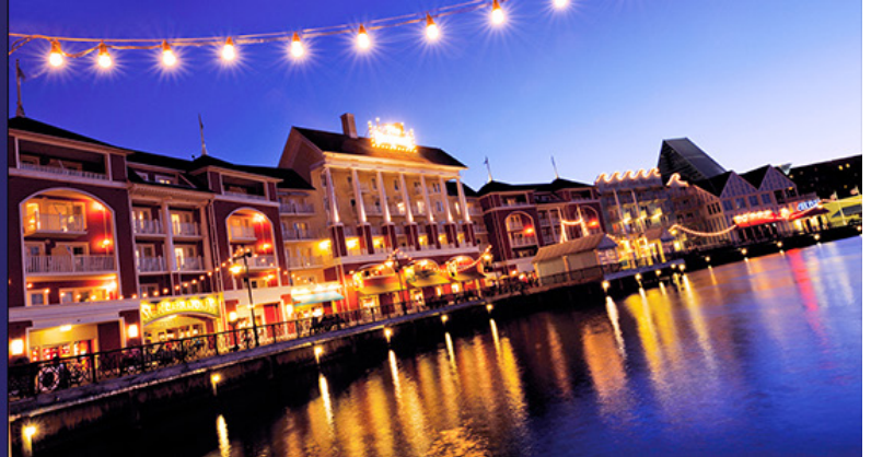
Exhibit and Sponsorship Opportunities

Don't miss this unique opportunity to demonstrate the value of your products and services outside of today's crowded marketplace!